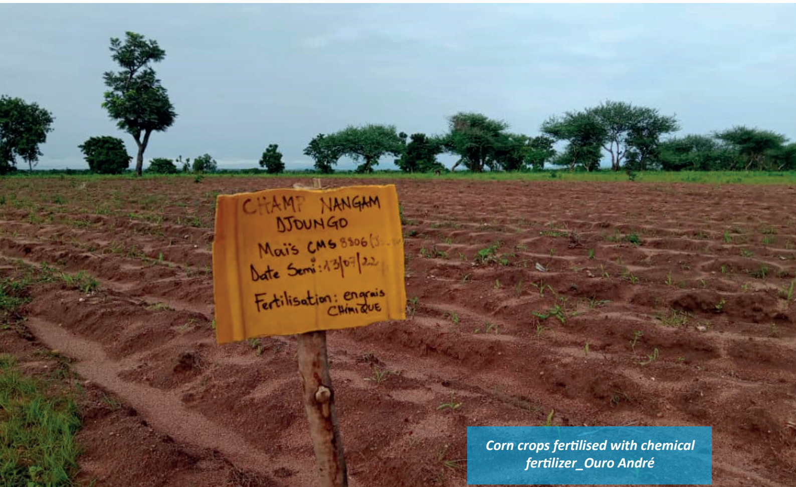
Corn crops fertilised with chemical fertilizer_Ouro André