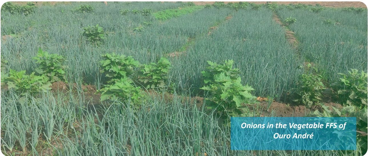
Onions in the Vegetable FFS of Ouro André