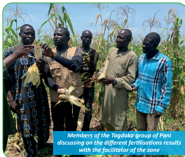
Members of the Tagdaka group of Pani discussing on the different fertilisations results with the facilitator of the zone

A total number of 09 Farmer Field Schools (FFS) were established in nine (09) communities living along the BNP, notably in the localities of Banda (HZ 1 1), Dogba (HZ 4), Na'ari, Agorma (HZ 7), Ouro André (HZ 8), Larki, Pani, Wafango and Mboukma (HZ 9). These FFS gather between 20 and 25 interested and available farmers. These farmers are being equipped with natural soil